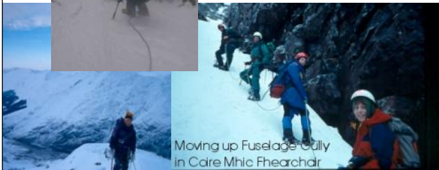
Moving up Fuselage Gully in Coire Mhic Fhearchair