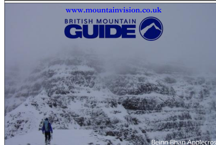
Beinn Bhan Applecross