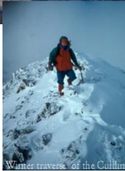
Winter traverse of the Cuillin

As the name of the course suggests - five days is spent trying to ascend as many of the 11 Munros on the Cuillin As the week and conditions Allow. Some of the days will involve the use of the rope for 'moving together' whilst roped. Also some experience in abseiling, or at least a willingness to learn quickly, would be an advantage. This course would suit those people who might have had some experience of the Cuillin in Summer, but would like to experience these beautiful & addictive mountains under snow or at least winter conditions.