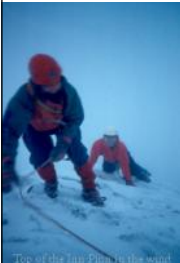
Getting to the top of the In. Pinn.

- Five days attempting some of the best Cuillin scrambles. The Pinnacle Ridge of Sgurr nan Gilleann. The 'round of Coire Laggan, including the Inn. Pinn. depending on the time available. Rileys Window on Sgurr Dearg, followed by the Inn. Pinn. The ascent of the Sgurr an Fheadain, followed by the traverse of Bidein Druim nan Ramh. All of these days demand good scrambling ability.