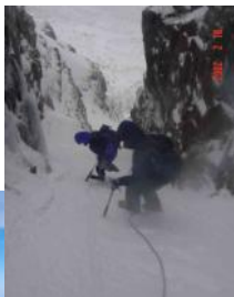
Descending the Way Up (Grade I) on Liathach