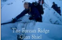
The Forcan Ridge Glen Shiel